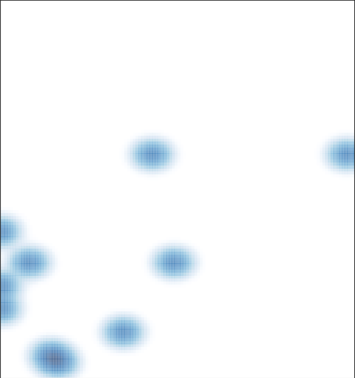
# features = 10 , max = 1